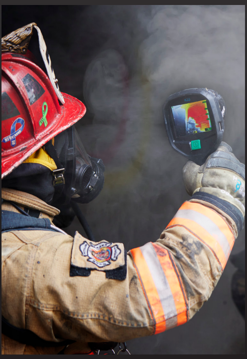
*Featured on select Kxx models only

We designed our line of TICs to withstand the toughest firefighting conditions, whether it's a two-meter drop, heavy water spray, or blazing hot temperatures. The Kxx-Series offers affordability without sacrificing the reliability, clarity, or performance that first responders expect from FLIR. The glove-friendly, large-button design makes operation simple and straightforward.