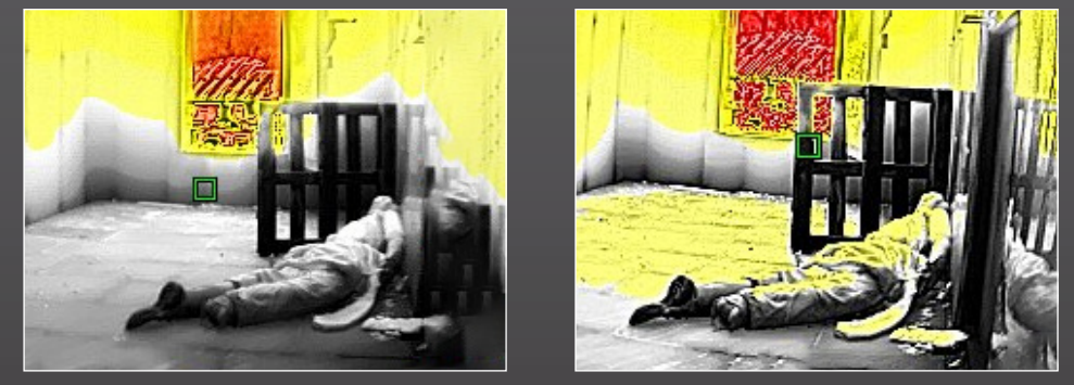
Thermal from original Kxx-Series model vs. thermal from 2024 enhanced Kxx-Series model