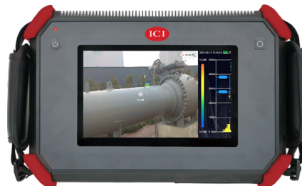
Sound Detect Pro

Constructed with 128 individual microphones, the ATEX certified explosion-proof Sound Detect Pro leverages ultrasonic frequencies and microphone array beamforming technology to quickly detect potential air, gas, and vacuum leaks in noisy industrial environments. Also find partial discharge faults from electrical devices. The Sound Detect Pro displays information related to partial discharge type, estimated leak size, and earnings loss values. The camera also comes with a built-in processor that pinpoints a leak's location on-screen. Real-time sound image display, assists users in detecting hazards significantly faster compared to previous methods. Does not include Wi-Fi or Bluetooth.