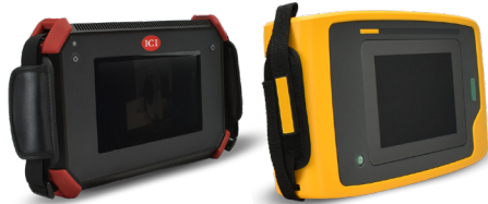
Sound Detect Pro